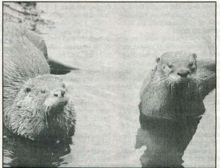
AT HOME HERE: It is river otters and not sea otters that make their home in and about the sea of the Gulf Islands. While some sea otters can be found in a few places on the B.C. coast, they are not found here in the islands.

River otters can be surprisingly large, with some males recorded over 122 centimetres (48 inches) long and up to 14 kilograms (30 pounds) in weight. When diving, their ears and nostrils close on their broad flat heads, and their short legs, webbed feet and long tail propel them effortlessly through the water.