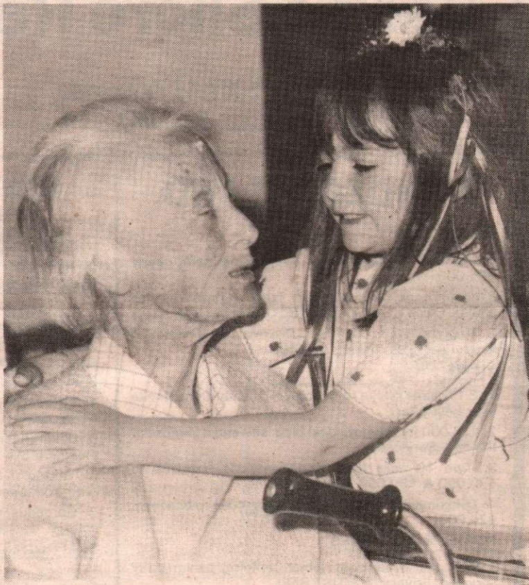
Driftwood