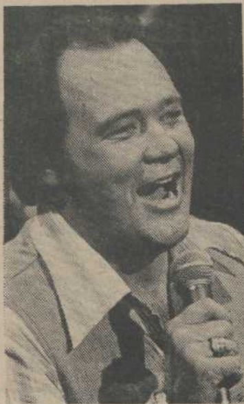
David Clayton Thomas belts out all his hits on CBC-TV's Super Special on Sunday, April 3rd at 8 p.m.

being done and what could be done. He urged that everyone write letters to M.P.'s and M.L.A.'s demanding that action be taken to prevent a disaster from occurring in local waters.