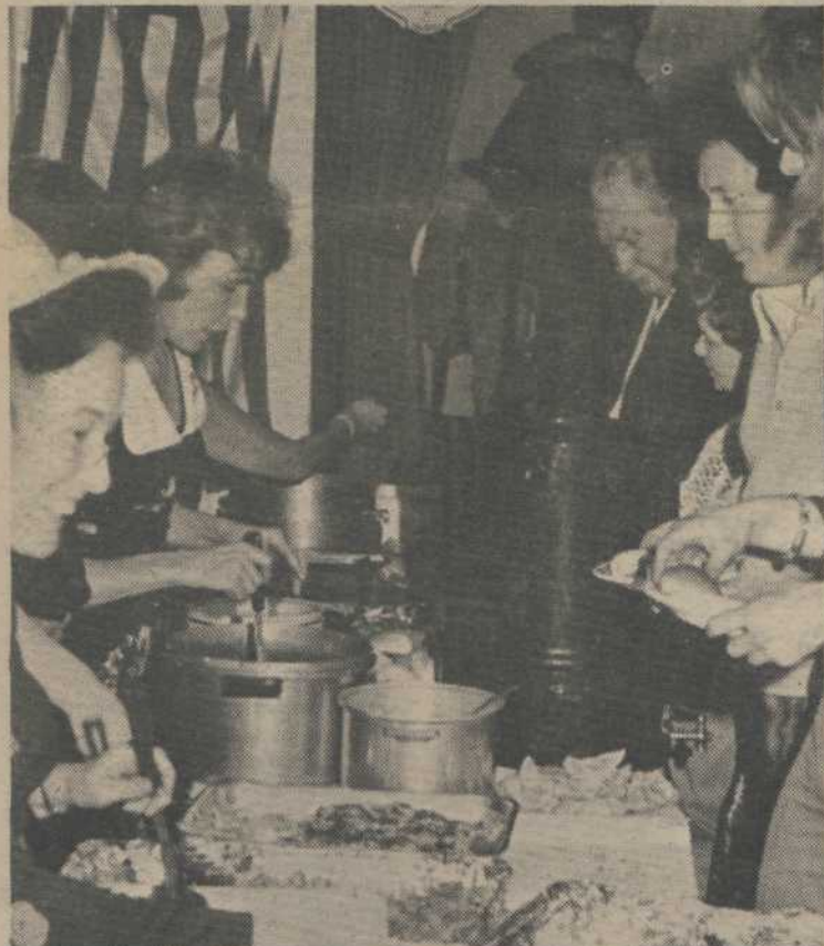
Serving the hungry hordes was a long job for the volunteers on Saturday night.