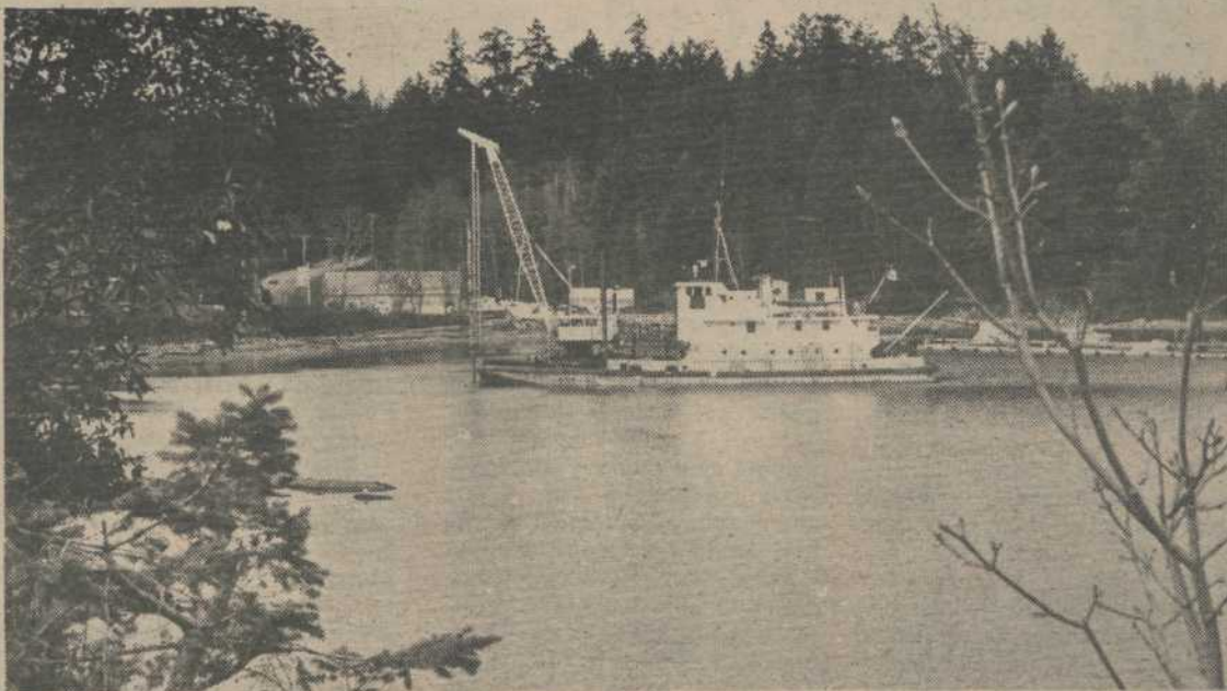
Essington, federal department of the environment ship is seen working in Ganges Harbour. The

ship was in Ganges for a couple of days, checking out the harbour bottom.