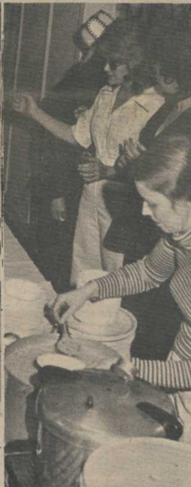
Clam chowder started the whole thing off. Here it is coming from the pot.