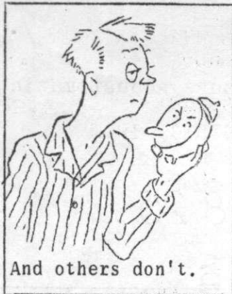
And others don't.

Some people like getting up early in the morning and others don't. And in this Gulf Islands boat question, widely different views also are held strongly. Your editor considers the matter one of dollars & cents: the run doesn't pay (even with only 2 island ports of call it probably still doesn't pay), Can we make it pay, & if so how?